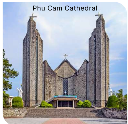
Phu Cam Cathedral