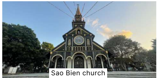
Sao Bien church