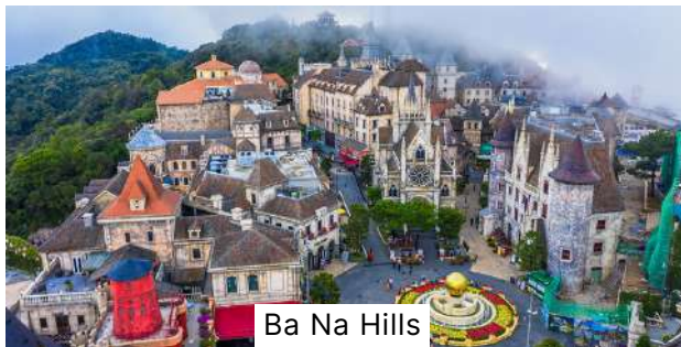
Ba Na Hills

Note: Time for public mass – Our Lady of Sao Bien: At any time in day.